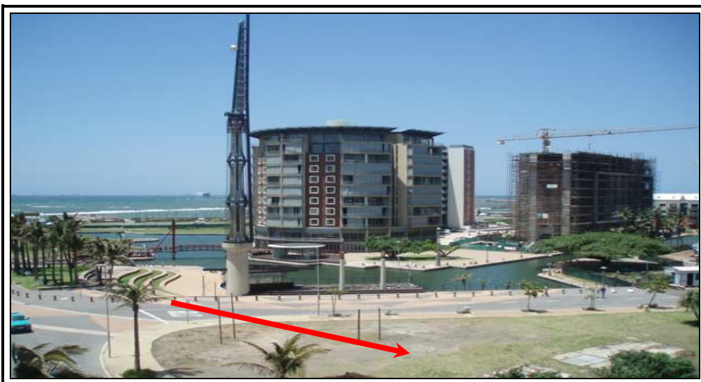
Prime Central Position of “One Point One Seven” overlooking Timeball Square with sea views

One Point One Seven is positioned in the very heart of the Durban Point Waterfront & Marina Precinct and overlooks Timeball Square Canal, which is the focal point of the entire precinct. Our new development will offer magnificent views, with most of the apartments offering superb views of the precinct's canals and our own private canal and moorings, which run through our development. A large percentage of the apartments will also offer panoramic ocean views, city centre views or harbor views, or a combination of all of these.