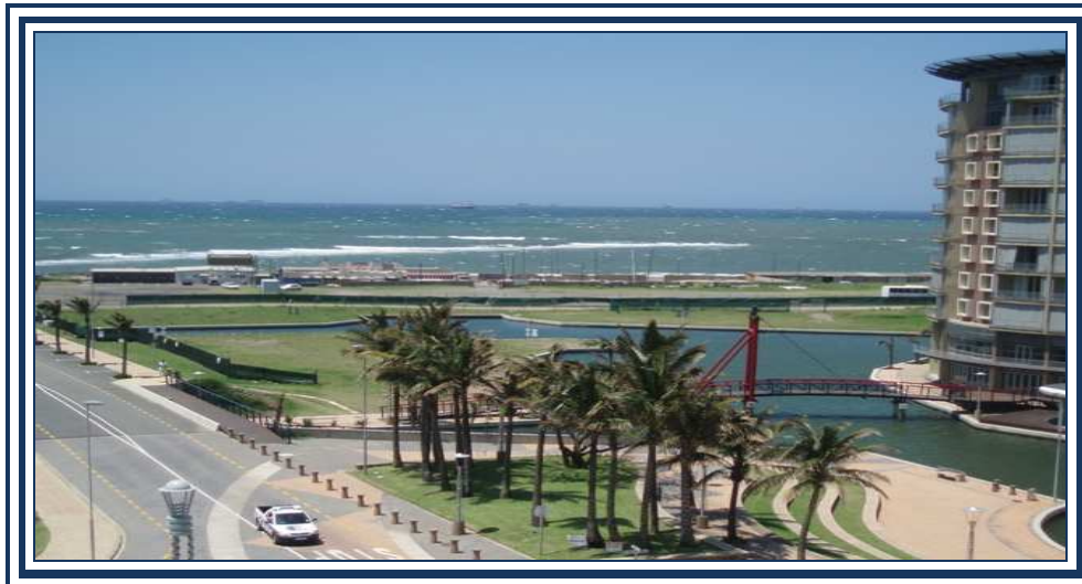
Wonderful views over canals to the beach, ocean and future off shore marina

To date 35 residential and 10 retail options have already been secured. Naturally this number will change daily, so in order to maximize your opportunity and secure the benefit of keener pricing and a better choice of apartment, ensure that you apply for your option at your very earliest convenience.